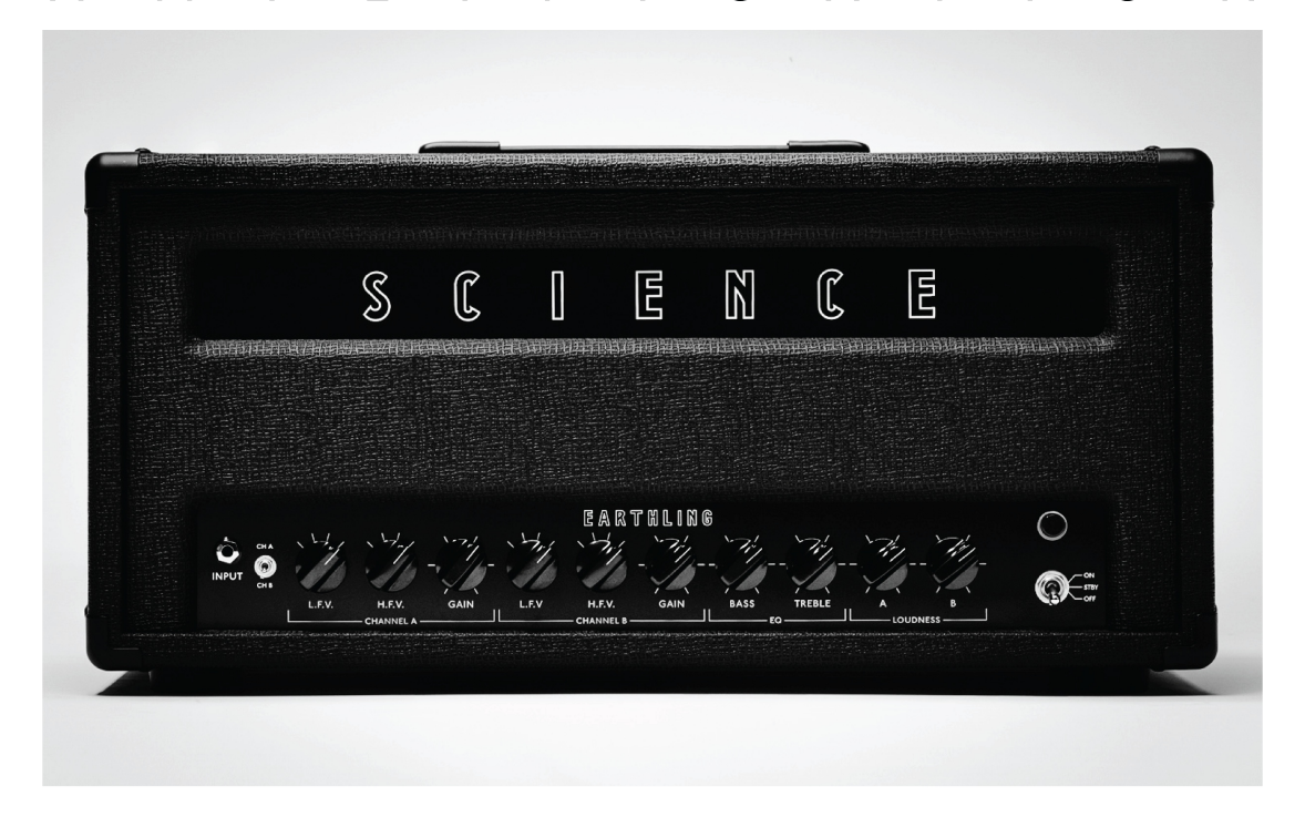
EARTHLING DUAL CHANNEL